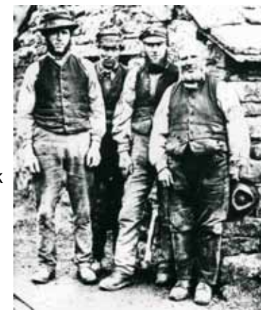
North Pennine lead miners

The dales were bursting at the seams with scores of mines and thousands of miners and their families – a boisterous, energetic and young population hungry for work and dreaming of wealth. Reality for most was a life cut short by lung disease and a constant struggle to make ends meet. A miner’s life was a hard one, as you can discover at Killhope Lead Mining Museum.